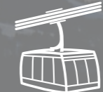
AT Aerial tramways