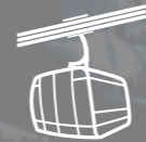
BD / TD Bicable / tricable gondola lifts