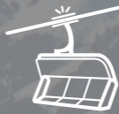
CF Fixed-grip chairlifts