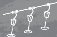
SL Surface lifts