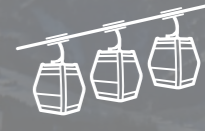
GFR Reversible gondola ropeways