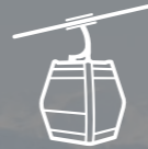
GD Detachable gondola lifts